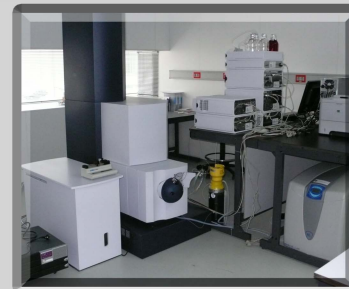
Bruker maXis QTOF Mass Spectrometer

For more information please contact us: info@medinaandalucia.es