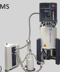
NMR data acquisition (one and two dimensions)