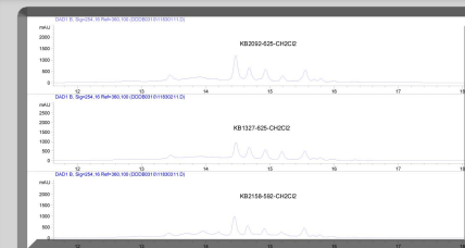
LC/MS acquisition and data processing LC/MS (low and high resolution)

For more information please contact us: info@medinaandalucia.es